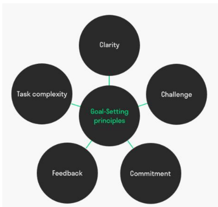
Figure1 : Locke's Goal-Setting theory

The theory of goal setting reflects on the fact that there should be an accurate balance for ensuring the right level of challenge before setting challenging goals. Therefore, a company's management should ensure that goals are neither too simple nor too difficult to achieve as it can make adverse impact on performance and motivation of employees. This issue leads to the challenges of employee retention which is a significant aspect of organization's performance. Lastly, management or leaders should analyze the needs of workforce and collect all of the pertinent information based on the state of organization. On the other hand, Morecroft (2015), Management of a company should take feedbacks from the workforce for determining if they are doing it right. Based on the feedbacks, management would check if they are heading towards right path. Complex goals have the ability to influence morale, motivation and productivity. Thus, while establishing a goal, adjusting complexity and level of difficulty is needed to be done. If the workforce gets enough time to accomplish the goals and enhance performance, it can help in making innovative approaches towards maintaining development.