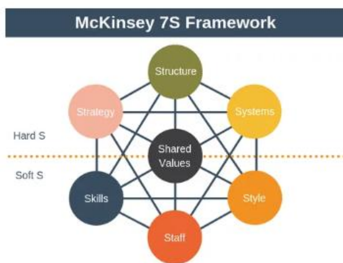
Figure4 : McKinsey's 7S model

motivated staffs. According to the model, managers can identify where they need to work on and improve performance. The hard elements of the models are strategy, structure and systems are easy to analyze and are directly influenced by Management. Such as, systems can be formal processes and IT system and strategy can be analyzed as it comes in strategy statement. Structure of the organization can be easily accessible as it comes with organization charts and reporting lines. Whereas, Soft elements such as Style, Staff, skills and shared values are difficult to understand and tangible. These factors are majorly influenced by culture. In order to perform well, each of the elements is needed to be aligned with one another.